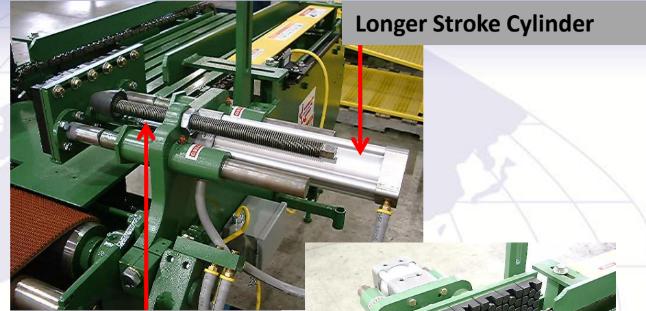
Adjustable Stop Rod, w/Bumper Stop

382.901.6. Call Columbia to verify kit needed